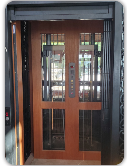
Elevator car features Unfinished Mahogany Flat panel walls prepped for glass.