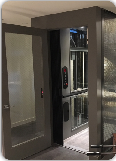
Elevator car features Shaker panels prepped for glass with custom paint finish and flooring.

Symmetry is masterful at creating custom residential elevators designed and built to reflect your personal taste and complement your surroundings.