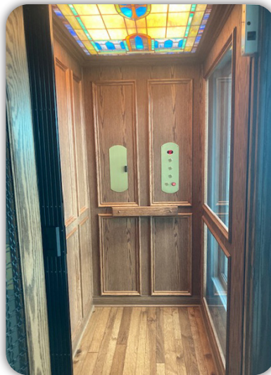
Elevator car with Red Oak panels, custom stained finish, wall prepped for glass and custom stained glass ceiling provided by others.