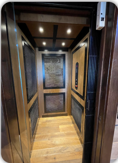
Mine Shaft elevator car in White Oak with stain finish, steel framing and mesh windows in Black and custom hardwood flooring.