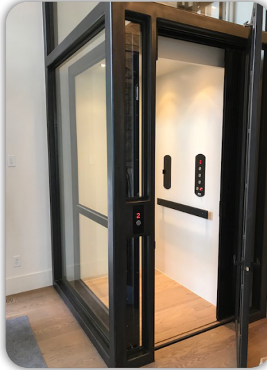
Elevator car features Maple Flat panel with custom stain finish, Black painted steel frame with wall prepped for glass.