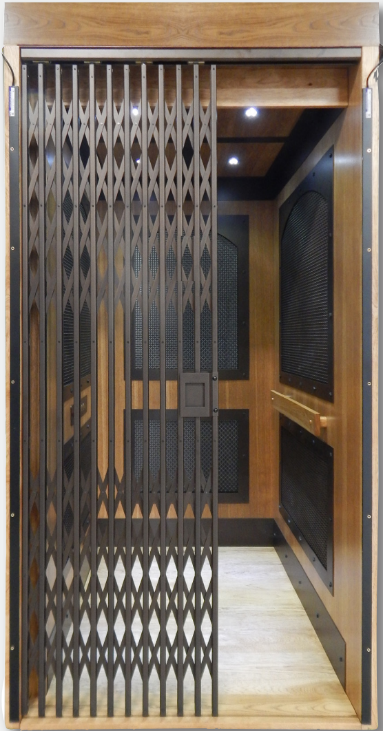
FRONT VIEW with Enterprise Collapsible Gate