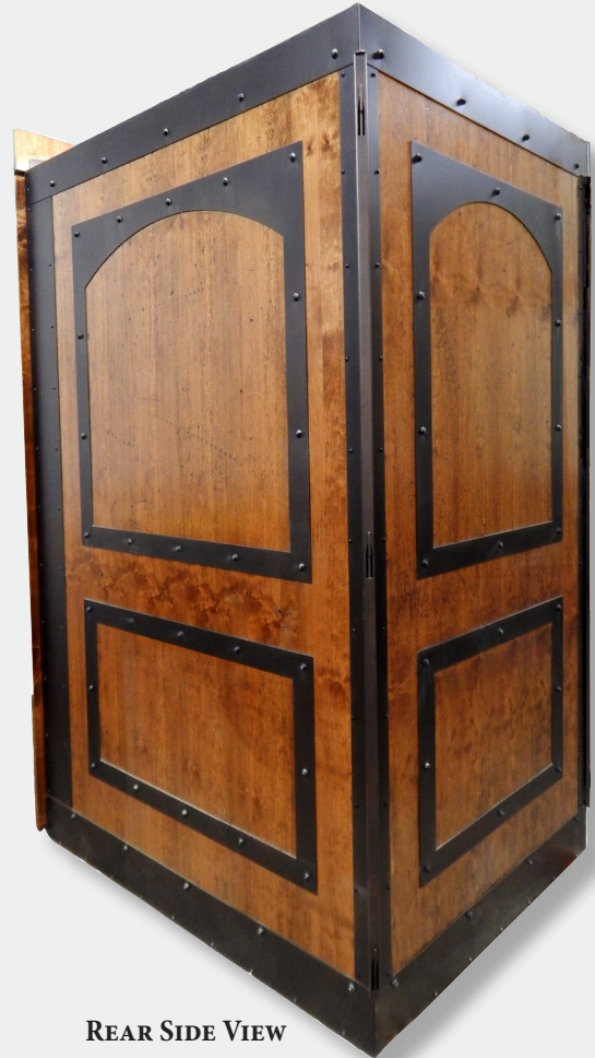
REAR SIDE VIEW

The Distressed Wood Mine Shaft Elevator Car is shown with “distressed” Alder hardwood panels with Provincial stain and Clear Coat finish. Cathedral- and Classic-style steel frames featured with Vintage Bronze finish.