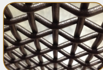
WIRE MESH shown with Vintage Bronze finish.