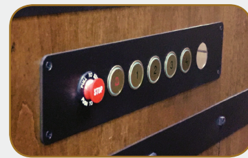
HORIZONTAL CONFIGURATION CAR OPERATING PANEL pictured in Vintage Bronze finish with Brass buttons.

To learn more, visit us at symmetryelevator.com or call 877-375-1428.