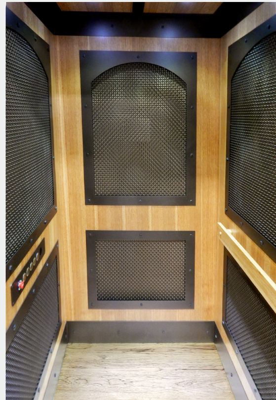
ELEVATOR CAR INTERIOR

The Wire Mesh Window Mine Shaft Car is shown with Hickory panels and Early American stain and Clear Coat finish. The Cathedral- and Classic-style wire mesh windows and frames are featured in Vintage Bronze. Enterprise Collapsible Gate shown in Vintage Bronze.