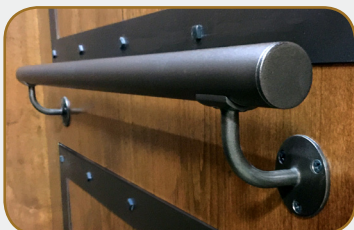
HANDRAIL shown with Vintage Bronze finish.