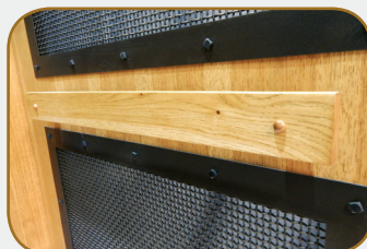
HARDWOOD HANDRAIL finished to match the cab.