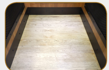
HARDWOOD FLOOR shown with Clear Coat finish.

To learn more, visit us at symmetryelevator.com or call 877-375-1428.